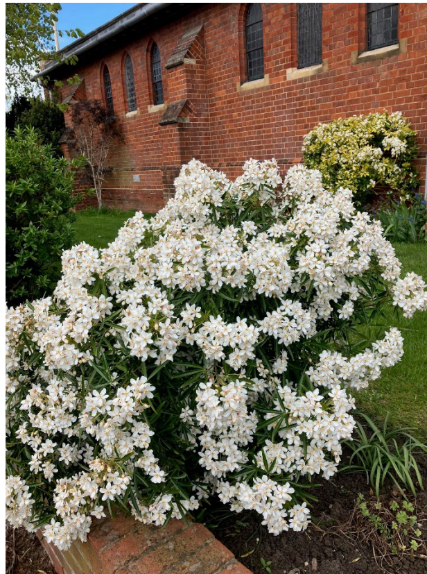
Choisya Aztec Pearl, in All Saints Rd – Brigid