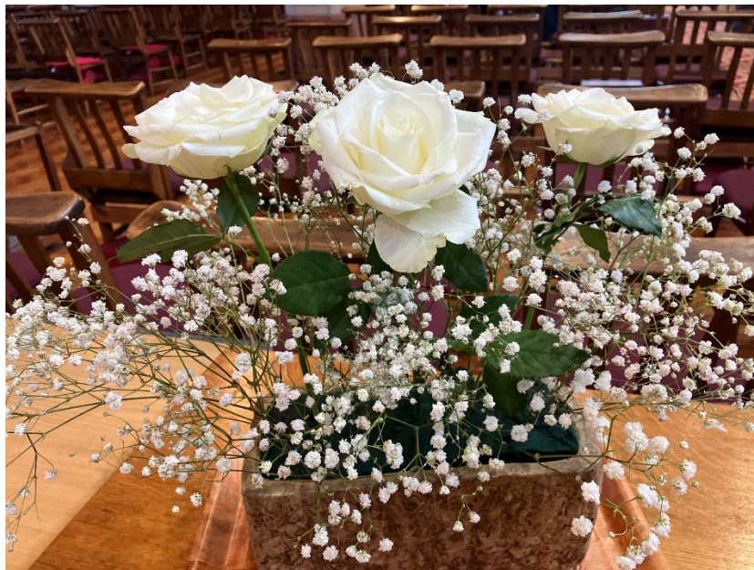
Valerie's beautiful Easter flower arrangement