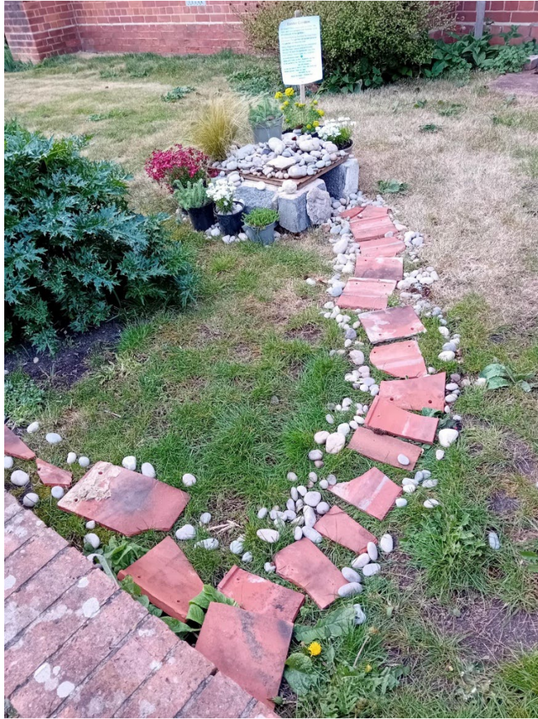
The finished Easter Garden