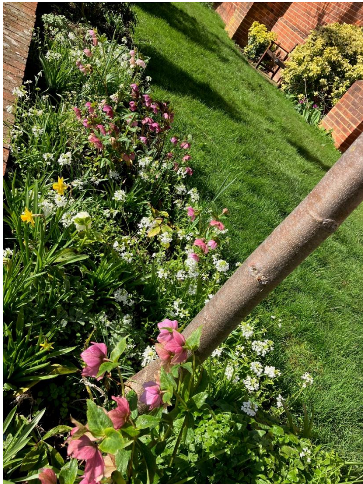
Arabia variegata and hellebores, All Saints Road – Brigid